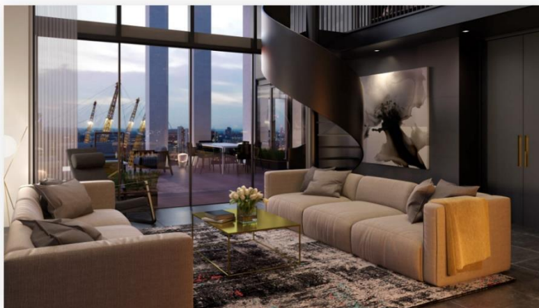
The Waterman Greenwich Peninsula "I liked the design of the building from the first sight – it is sleek and modern, great colours of the lobby and the lift area." – Irina (Owner), April 2020